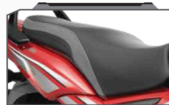
PREMIUM dual-tone seat