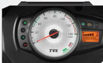
multi-functional digital console