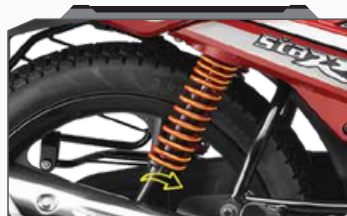
5-STEP adjustable shock absorbers