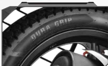
DURA grip tyre