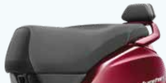
LONGEST FLAT SEAT