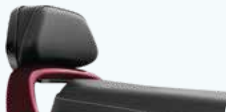
COMFORTABLE BACKREST FOR PILLION RIDER