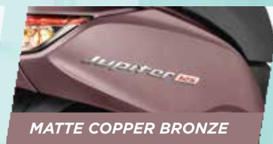
MATTE COPPER BRONZE