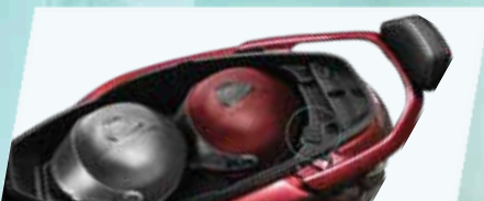
LARGEST 33L UNDERSEAT STORAGE