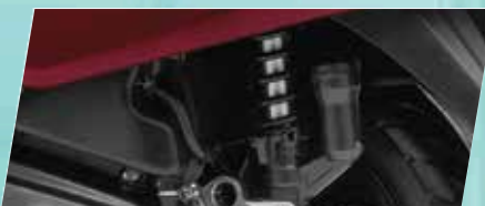
ADJUSTABLE REAR SHOCKS FOR EXTRA CUSHIONING