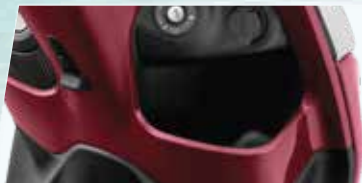
SPACIOUS 2L GLOVE BOX