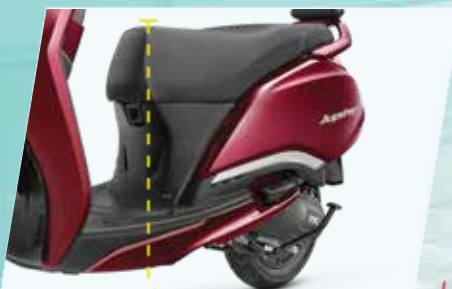
EASY GROUND REACH