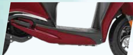
LARGE FRONT LEG SPACE