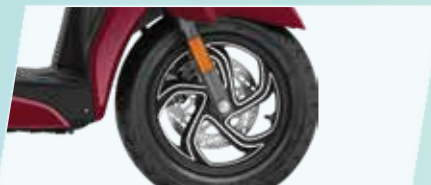
DIAMOND-CUT ALLOY WHEELS