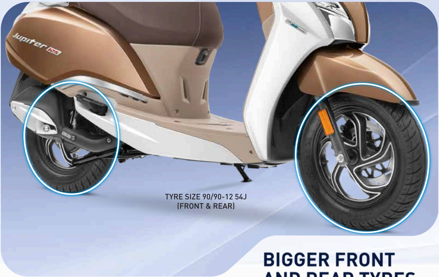
TYRE SIZE 90/90-12 54J (FRONT & REAR)